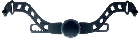
074501 Replacement turn dial adjustment kit for all Ares series helmets.