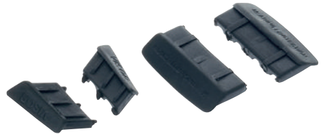
074504 Caps for visor and ear protection slots for all Ares series helmets (2+2 pcs).