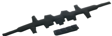
074506 Replacement mesh padding kit for all Ares series helmets (except Ares MIPS).