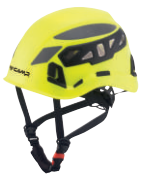
3 Fluo yellow / Reflective grey

- EN 397 + very low temperature (-20°C).