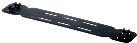
074505 Adapter kit for reducing the size for all Ares series helmets (except Ares MIPS).