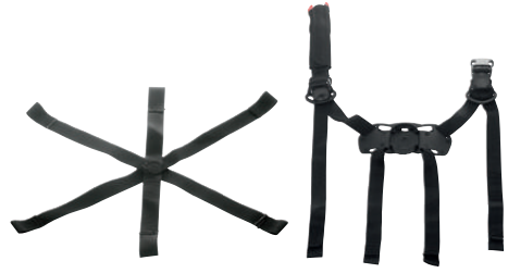
074502 Replacement chin strap kit for Ares, Ares Air Pro, Ares MIPS.