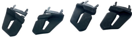
074503 Replacement headlamp holder clips for all Ares series helmets (4 pcs).